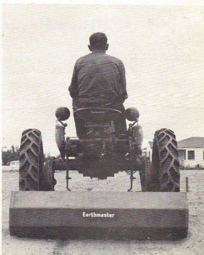
Earthmaster Scraper No. 165 — 5 feet wide — Hydraulic depth control